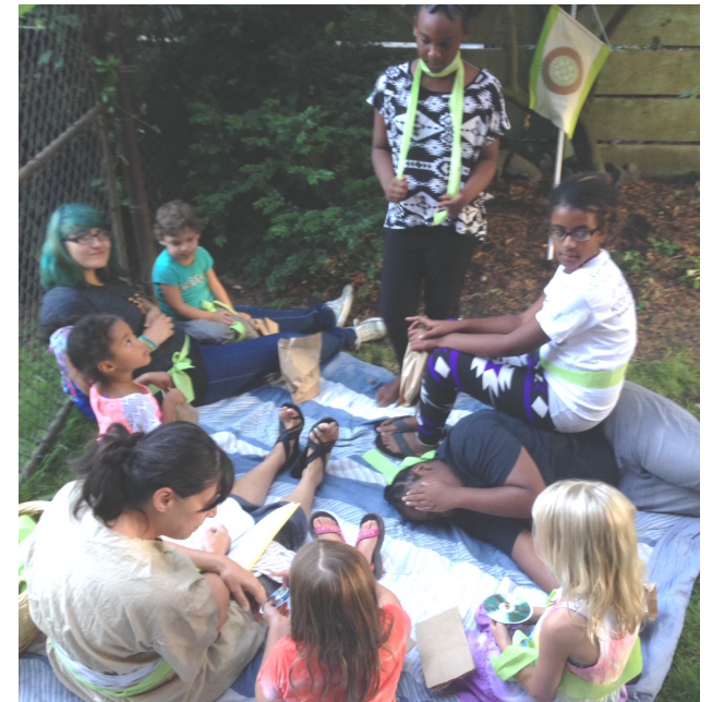
A family group meets to learn about the Bible during Summer Bible Adventure.

Interim Children's Outreach and Ministry Coordinator