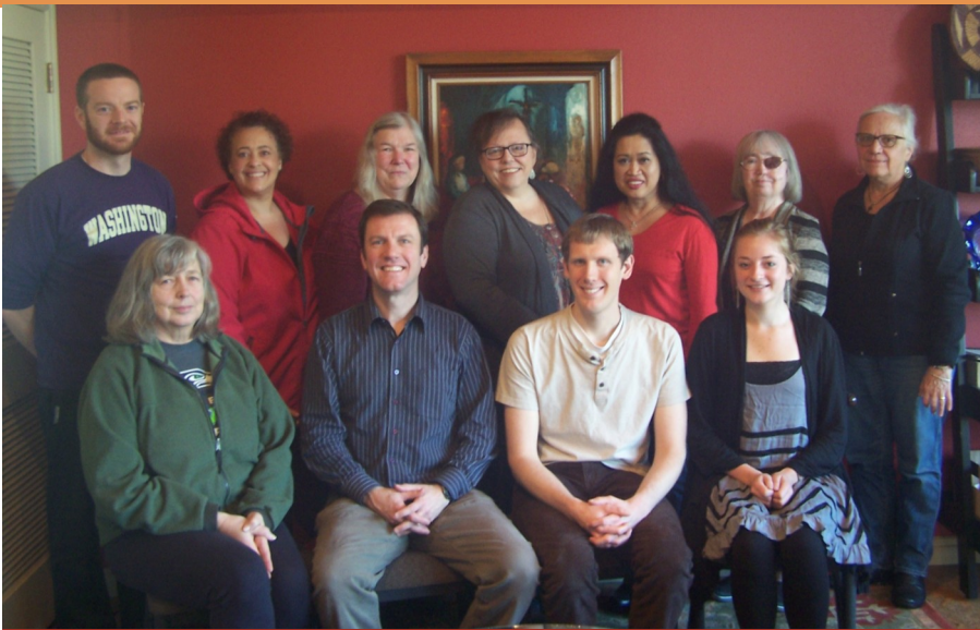
2016 Peace Lutheran Church Council