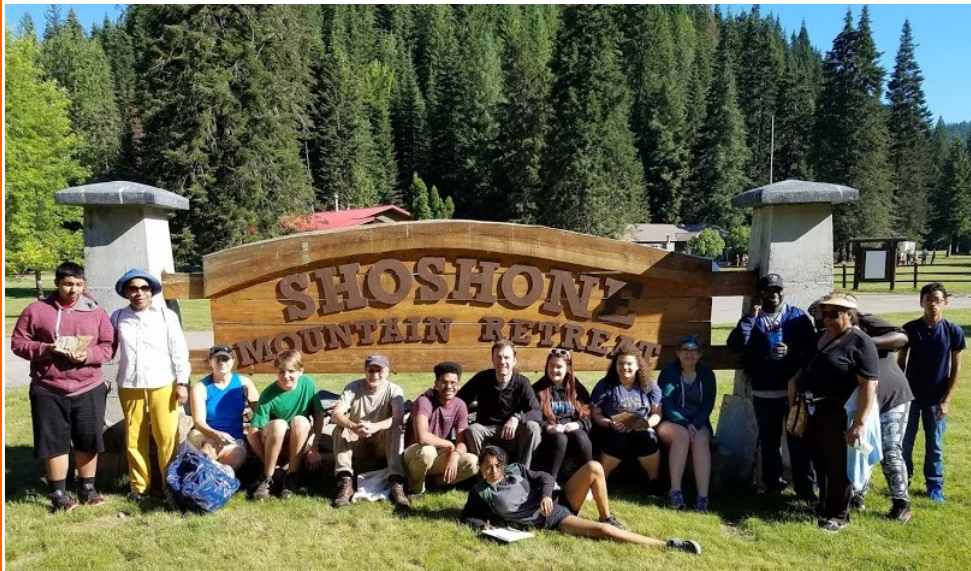
2016 Summer Mission Trip at Shoshone Mountain Retreat, Coeur d’Alene, Idaho

Wow, I must say that this has been an incredible summer for students, leaders, and families! We were so excited to offer an awesome summer mission trip this year to Shoshone Mountain Retreat in beautiful Coeur d’Alene, Idaho, a seven decade-old non-profit Christian camp and retreat ministry, originally founded by Lutheran congregations in Idaho, Washington and Oregon. The trip was highly formational for our ministry as youth drew closer to God and to each other.