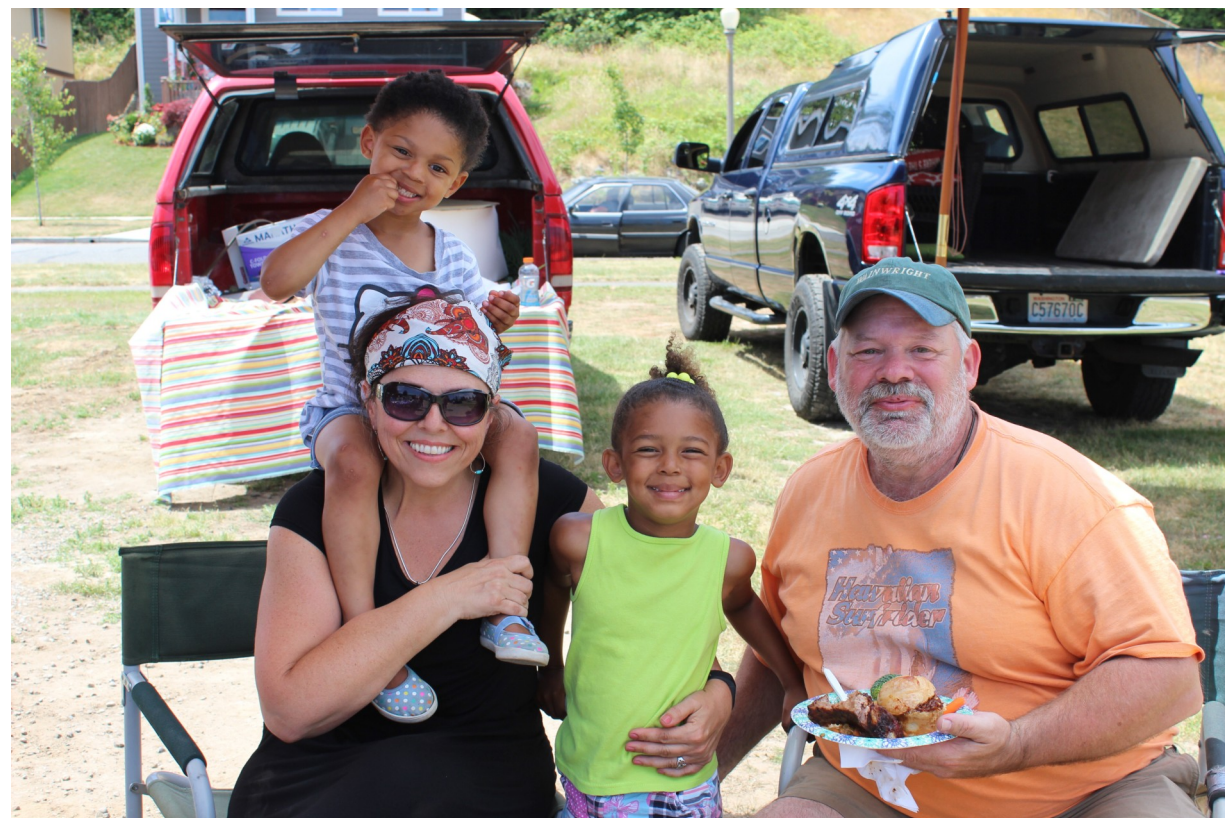
Children and families had a great time at the Tailgate Sunday event at Peace

Peace Lutheran Church, 2106 S. Cushman Avenue Tacoma, WA 98405, 253-383-1317 www.peacelutherantacoma.org — Find us on Facebook: Peace Lutheran Church Tacoma