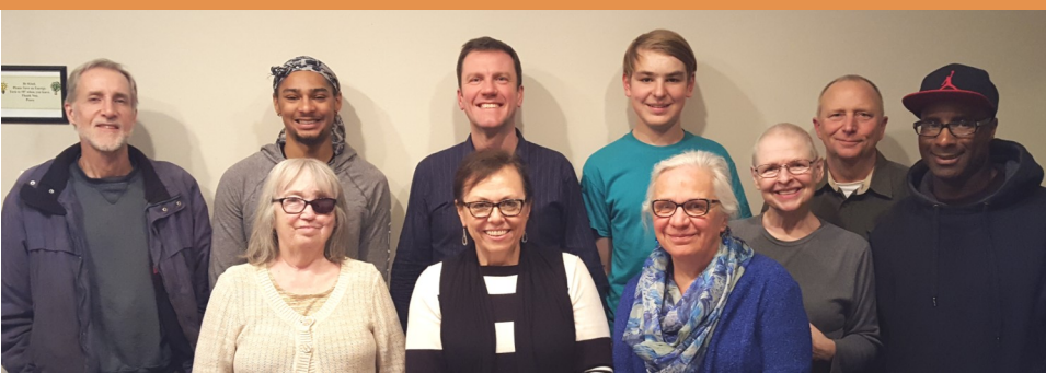
2017 Peace Lutheran Church Council