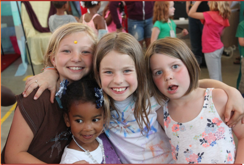
Children at Summer Bible Adventure!