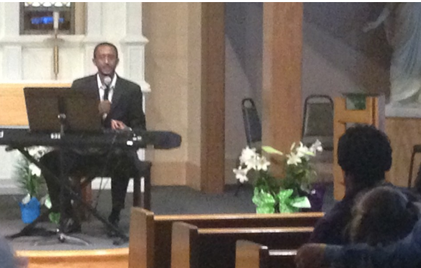
Concert Series at Peace