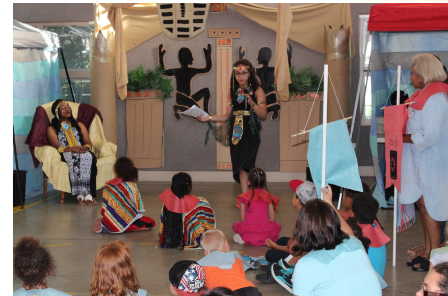
Summer Bible Adventure!