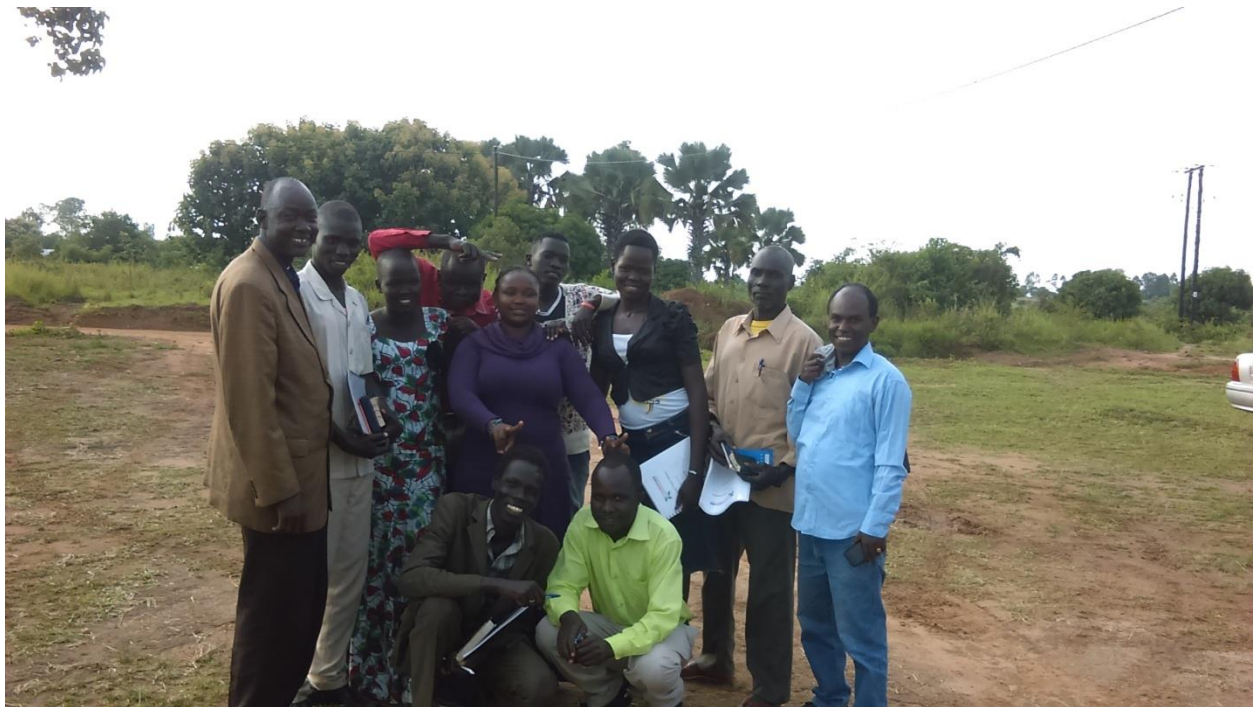
South Sudanese Anglican missionary team in Imvepi refugee camp in the Arua district, northern Uganda