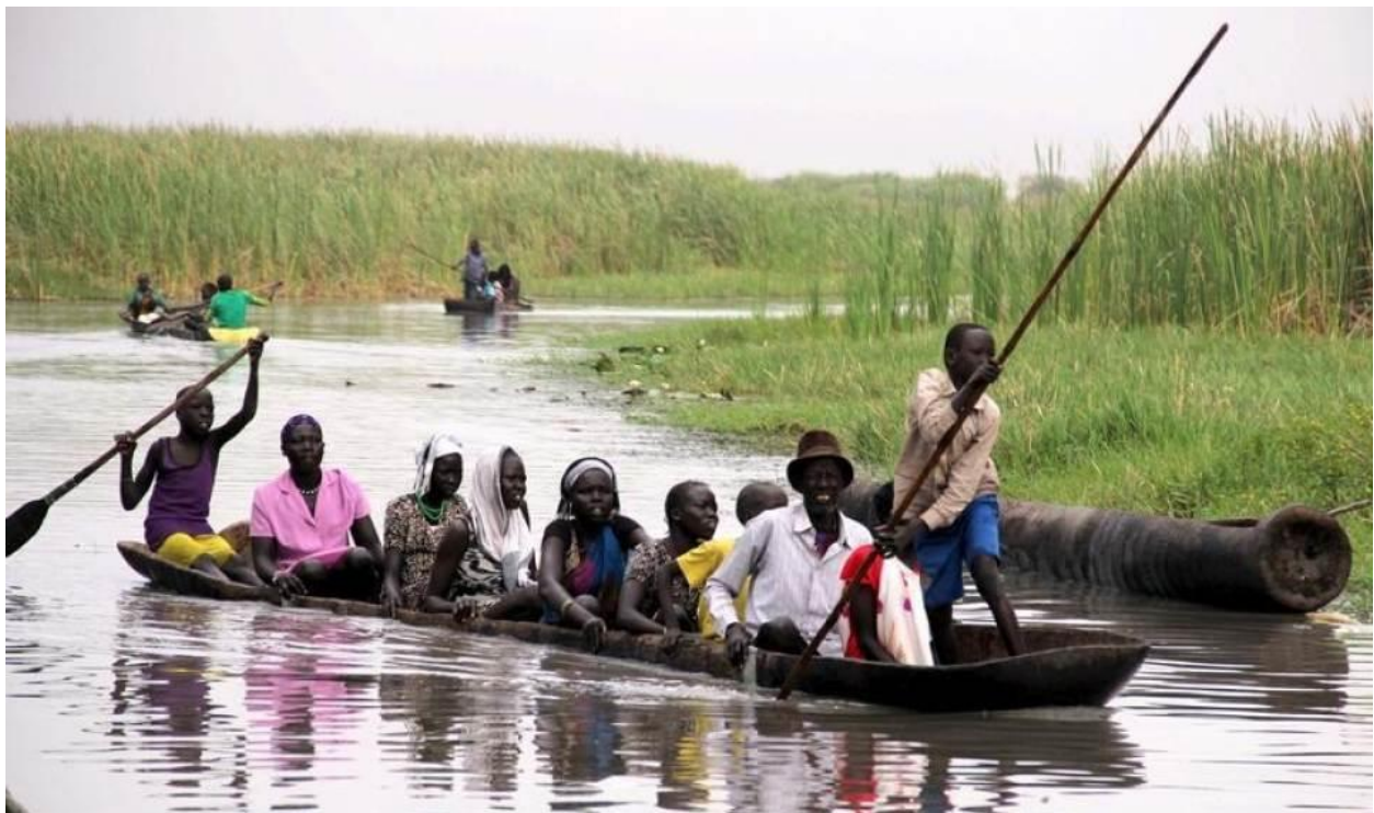
Gospel to all lands: We took a carriage into the heart of the residence in Nile River