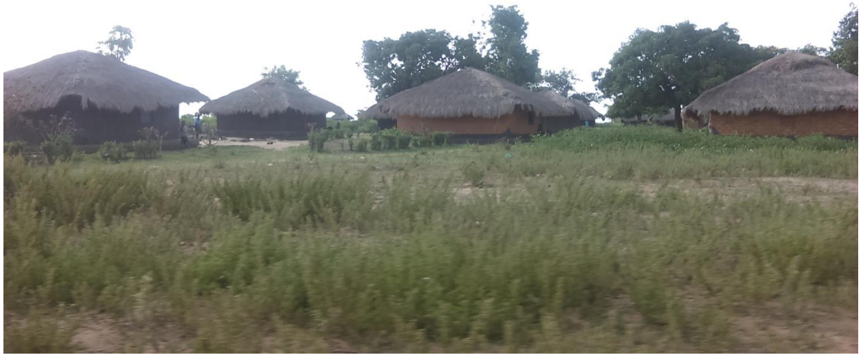
Explore Nyumanzi Refugee Camp, Building and more!