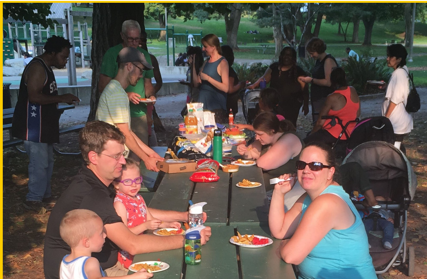
Families gathered at Wright Park for Peace at the Park