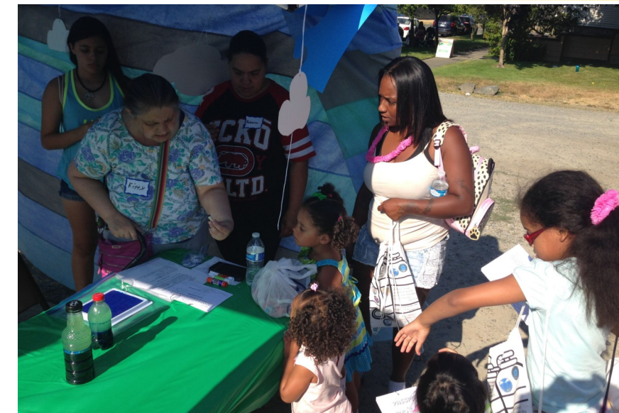
Summer Bible Adventure!