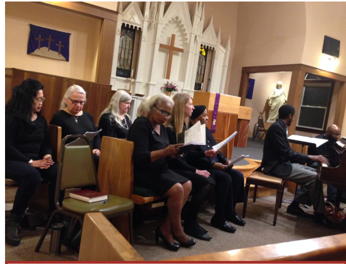
Gospel Choir during Concert Series at Peace

Living Lutheran is the monthly magazine of our ELCA (Evangelical Lutheran Church in America). If interested, please subscribe to it at livinglutheran.org . Cost is $20 per year or you can view the magazine online by visiting https://www.livinglutheran.org/issues/ .