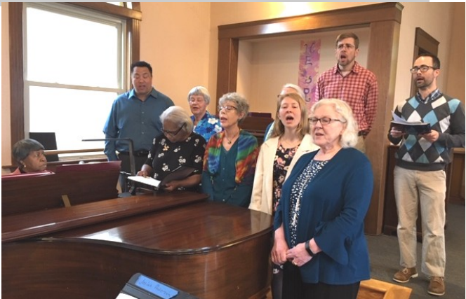
Gospel Choir singing praise!