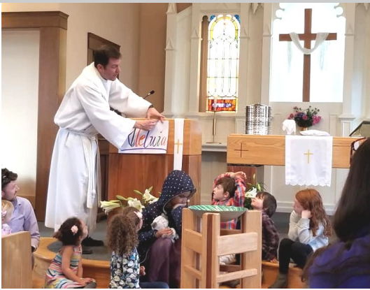
Children's message - bring out Alleluia!