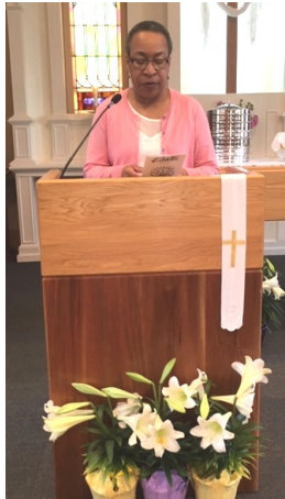
Hearing the good news: Christ is risen!