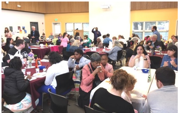
A wonderful Easter breakfast!