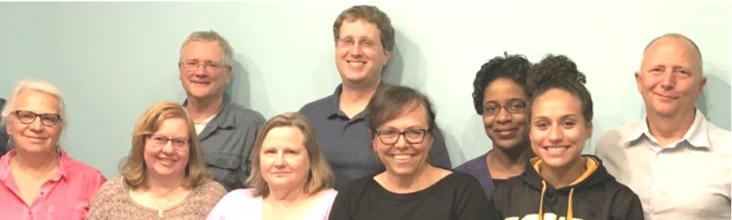
2019 Church Council

Thanksgiving is a special time to give thanks you for all you do for the ministry of Peace – your love of God and our family of faith, and your prayers for the work of Council. I am so very thankful for all God has done at Peace this year, and for these Spirit-filled people who graciously use their gifts to serve: