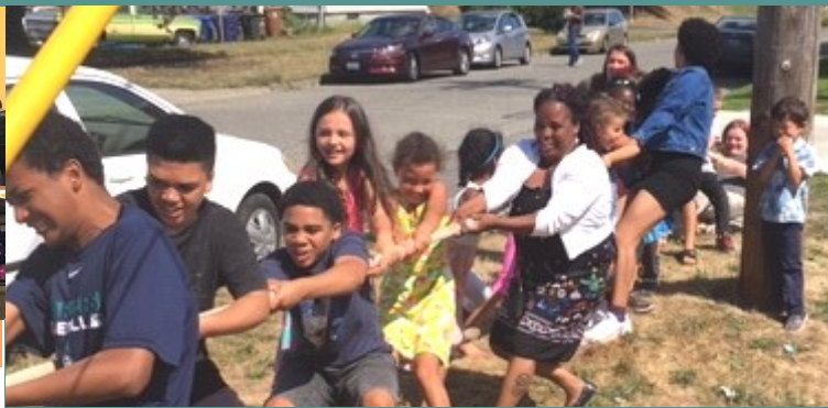
Tailgate Sunday!! Tug-o-war and church staff get pies in the face!