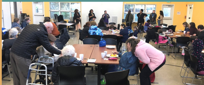
Peace Community Center staff speak at an adult forum