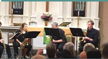
Grit City Sax Quartet concert at Peace