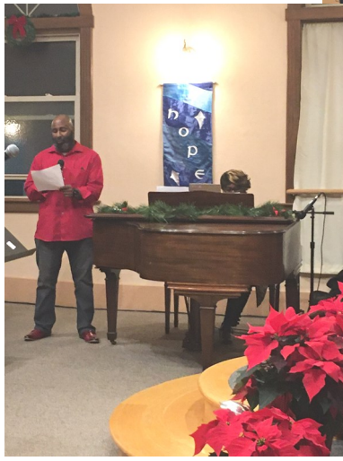
Christmas Eve worship