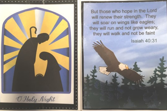
Card ministry cards