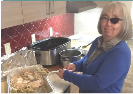
Serving a holiday meal to residents at Hilltop's Alberta Canada building.