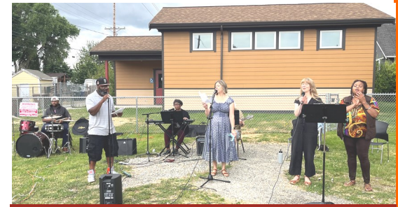
Musicians for outdoor worship