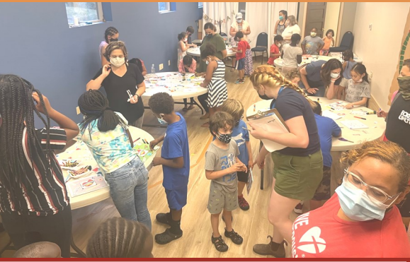
Summer Bible Adventure!

Hello Peace Families, What a wonderful summer it has been for the children and youth of our community. We have had several activities come and go already and are gearing up for the fall. But first looking back, we have had a busy couple of months for children and youth at Peace. Sunday morning children's worship time during 11 AM worship has been a blast. This is a time when kids are welcome to join during the sermon to learn new songs, hear a Bible story and reflect. As we enter fall I will be scheduling leaders for this time and would like to add two more people to help lead children's worship or Godly play during the 9:45 Faith Education hour. Please let me know if you would be interested in being involved in children's ministry this way.