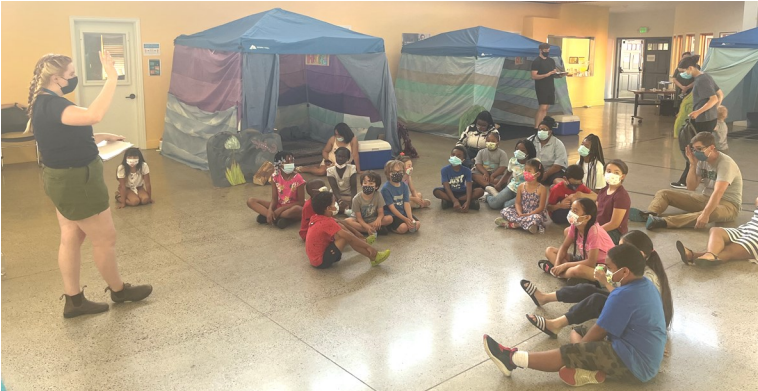
Summer Bible Adventure - Compassion Camp!

We worship in person Sundays at 8:30 & 11 am. We continue for now to use masks and increased airflow to reduce risk. Join live stream Sunday worship at 11 am on the church Facebook page, or check out the worship video later on the church Facebook page or YouTube channel.