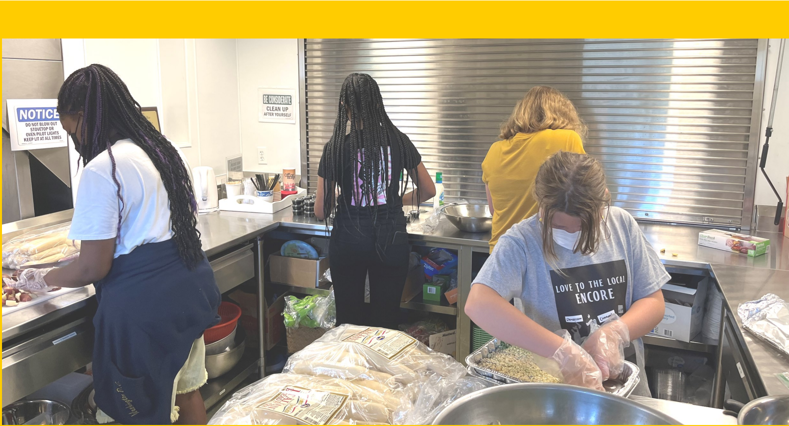
Peace youth prepare a community meal at this summer’s Love to the Local Servant Learning Week!