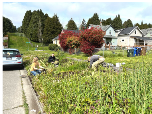
Gardening at Peace