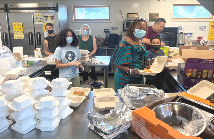
Church Council serves a Community Meal

Our housing ministry moves forward with the anticipated building of the DADU house. A cohort from Peace Lutheran is looking at ways we honor the history of the land and discern ways of how we are to be good and faithful stewards of this place that is now in our care. What are the good and appropriate uses of the land and assets that Peace Lutheran now occupies at the corner of South 21st and Cushman and surrounding area? There will soon be entry points for you to join with your thoughts, skills, and resources in this journey.