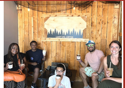
Hilltop Scholars enjoying refreshments at the Campfire Coffee shop.